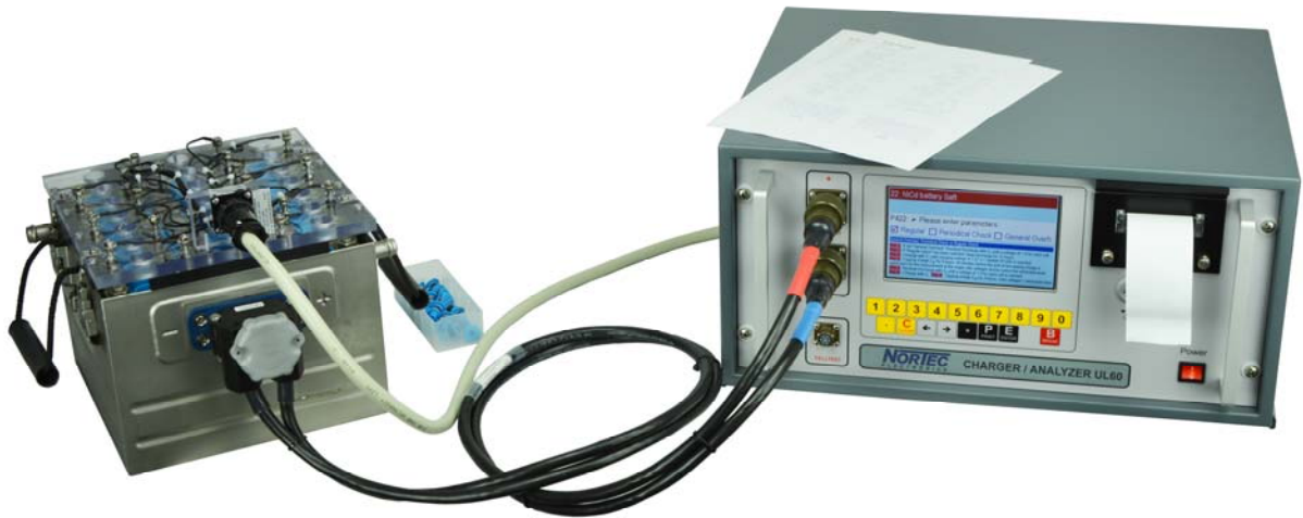
Automated cell measurement adapter for SAFT- Soft battery NiCd (type 2758) P/N: 305 001 251 023