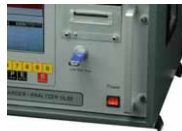
Software updates and data logging by USB