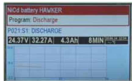
Graphic display and assistance on screen